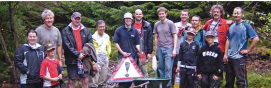
Some of the trail building volunteers ▲

Gisburn is a working and dynamic forest created and managed by the Forestry Commission. The forest and recreation facilities are likely to continue to change and evolve. For more information on what we do, visit: www.forestry.gov.uk/northwestengland